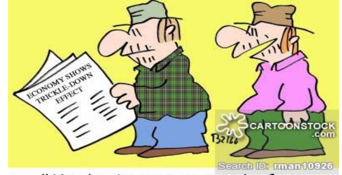
"Maybe it evaporates before it gets down to us."