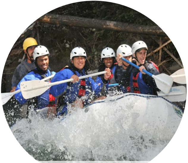
Experience nature through fun outdoor education including visits to local farms, forests, lakes, national parks, and research sites.

Intern with local conservation/ environmental organizations from across sectors in Michigan and develop a professional network (second year scholars).